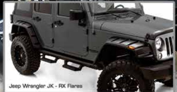
Jeep Wrangler JK - RX Flares