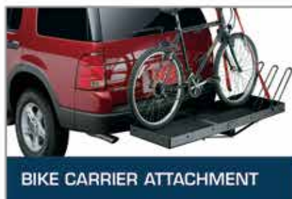
BIKE CARRIER ATTACHMENT