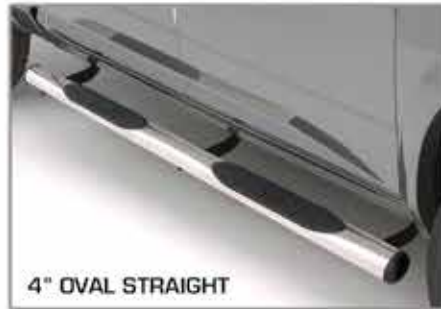
4" OVAL STRAIGHT