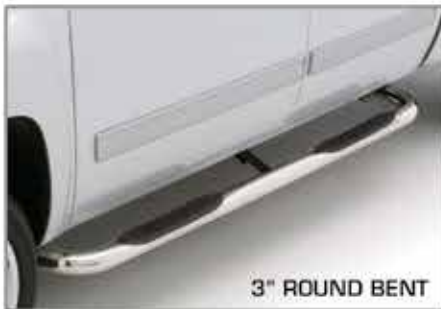
3" ROUND BENT