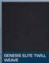
GENESIS ELITE TWILL WEAVE