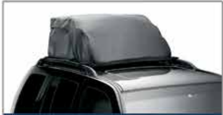
AERO ROOFTOP BAG