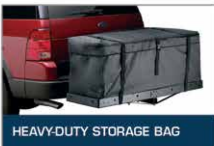
HEAVY-DUTY STORAGE BAG