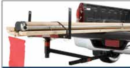
HITCH RACK BED EXTENDER