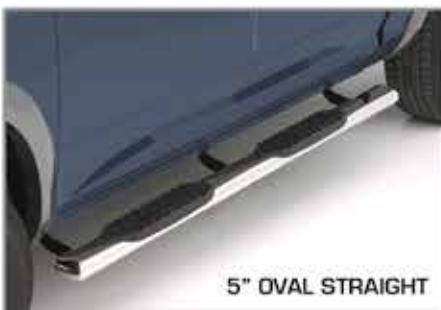
5" OVAL STRAIGHT