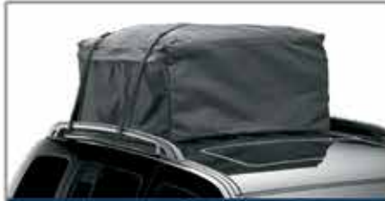
SOFT PACK ROOFTOP BAG