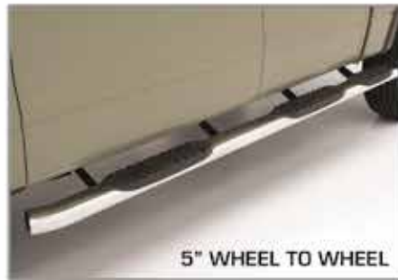
5" WHEEL TO WHEEL