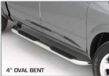
4" OVAL BENT