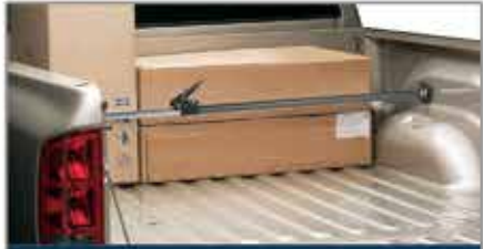
RATCHETING CARGO BAR