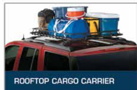
ROOFTOP CARGO CARRIER