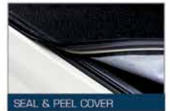
SEAL & PEEL COVER