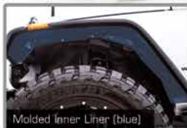
Molded Inner Liner (blue)