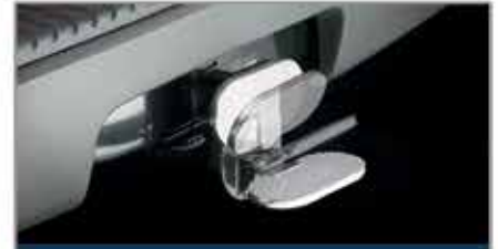
HITCH STEP universal