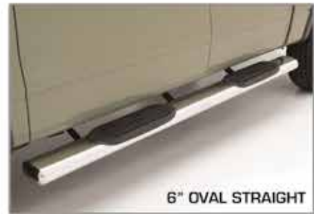
6" OVAL STRAIGHT