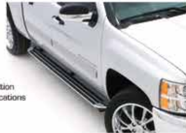
Durable Aluminum construction for Truck & SUV/CUV applications