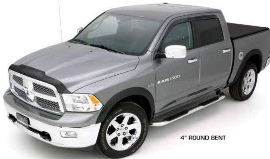
4" ROUND BENT